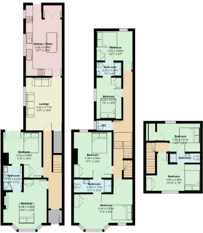
Colum Road, Cathays

Total Area: 181.8 m 2 ... 1957 ft 2 All measurements are approximate and for display purposes only